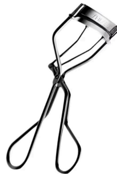
KELLY'S SMS: Shiseido Eyelash Curler , $35.

Heads up, we may share affiliate links below; this doesn't cost you anything extra, but if you make a purchase, we may earn a small commission. Thanks for supporting You Beauty, and happy shopping!