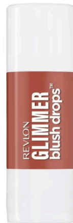
LEIGH'S SAVEY: Revlon Glimmer Blush Drops , $26.