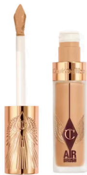
KELLY'S NEWBIE: Charlotte Tilbury Airbrush Flawless Blur Concealer , $53.