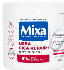
LEIGH'S EMPTY: Mixa Urea Cica Repair + Renewing Cream , $17.99.