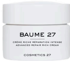
KELLY'S SPENDY: Cosmetics 27 Baume 27 Advanced Formula , $213