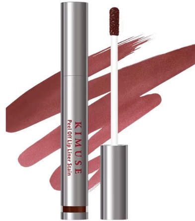
KELLY'S SAVEY: KIMUSE Peel Off Lip Liner Stain in Black Cherry , $19.99.